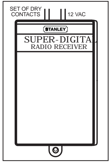
Note: 4 Wires shown. 3 Wires also available.